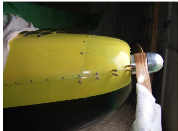
Cleco top cowling