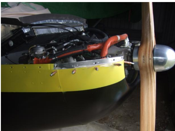
Fit fastener receptacles