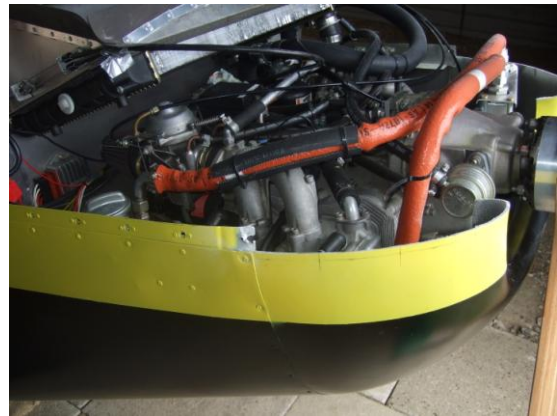
Cut nose bowl