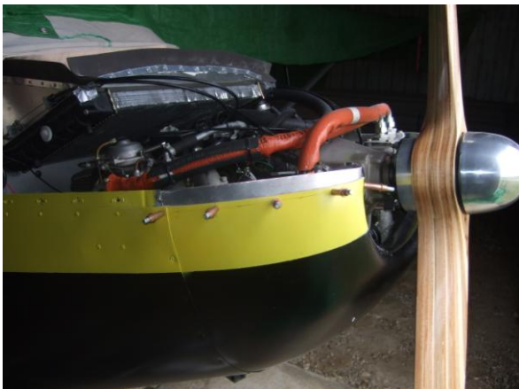
Cleco backing plate